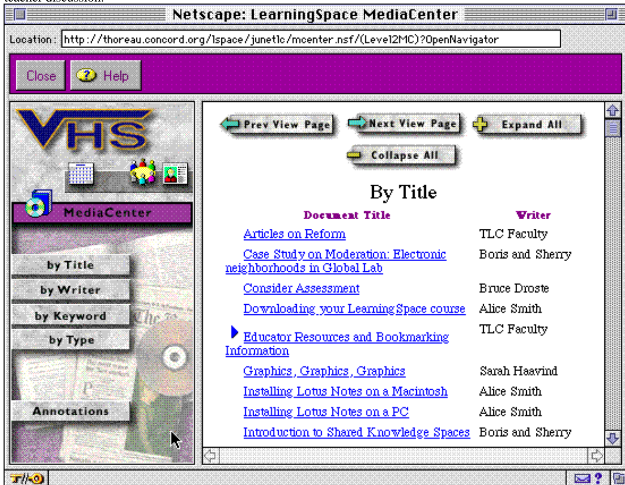
FIGURE 2: A view of the Media Center database from a Teachers Learning Conference.

leadership responsibility for moderating the main teacher discussion.